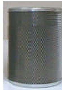
Carbon Media Filter Odor Control