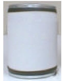
.3 Micron Particulate Filter

Since 1985, electrocorp has designed and manufactured industrial air scrubbers for clients such as the U.S. Navy, U.S. Army Corps of Engineers, Boeing, Dupont, and hospitals including Chicago General, Downtown New York Medical Center and Kaiser Permanente. Now we are able to bring these identical air cleaning capabilities into your home or small office. The electrocorp RAP-8 Air Scrubber is truly a dynamo. Use it in your kitchen, child's room, living room, bedroom or small office.